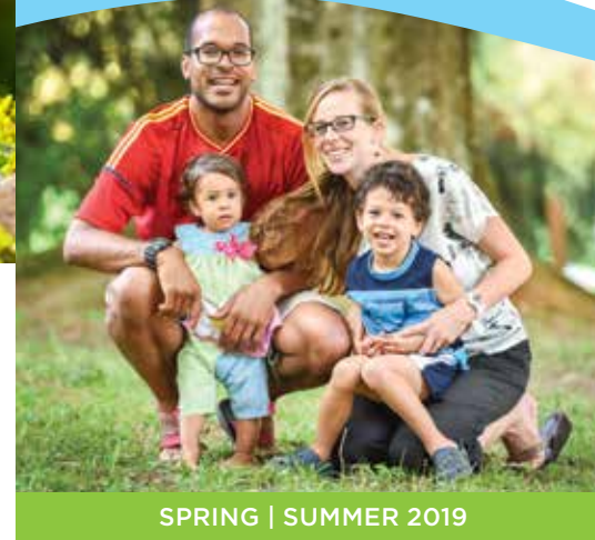
SPRING | SUMMER 2019

To report a street light that is non-operational, please call your local Municipal office.